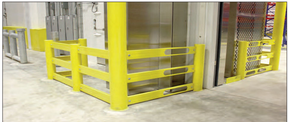
OPTIONAL BOLLARDING AND THRU-GUARDING