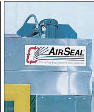
DIRECT DRIVE MOTOR