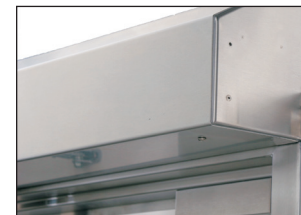
Sloped Shroud for Power Units For superior cleanliness and aesthetic appeal.