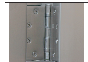
Fully Mortised Hinges (Shown on stainless steel door) Flush mortised hinges provide a clean and smooth finish to the door.