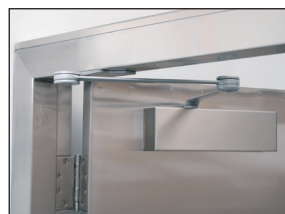
Stainless Steel Closer Cover (Shown on stainless steel fire door) Another option for superior cleanliness and aesthetic appeal.