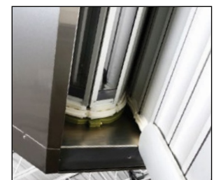
No Metal-to-Metal Contact