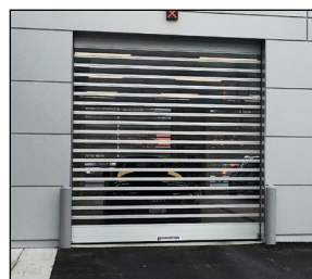
Full Width "All-Vision" Slats