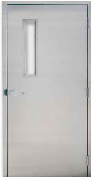
Shown with optional vision panel

Using cutting-edge technology and exacting criteria for quality, these doors have surpassed market demands and exceed cGMP, FDA and EU requirements. Our quest for uncompromising quality, and our steadfast commitment to meet our customers' ever-changing expectations, is evident in our ability to provide a comprehensive single source for all their door, hardware and integration needs.