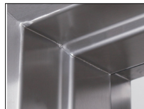
Frame Assembly Fully mitered and completely welded through the throat. Single or double rabbet