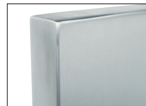
Frame Assembly Our seamless stainless steel panels are refinished and repolished on all four sides and corners.