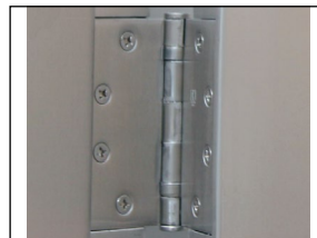
Fully Mortised Hinges Flush mortised hinges provide a clean and smooth finish to the door.