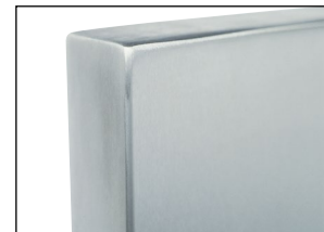
Frame Assembly Our seamless stainless steel panels are refinished and repolished on all four sides and corners.