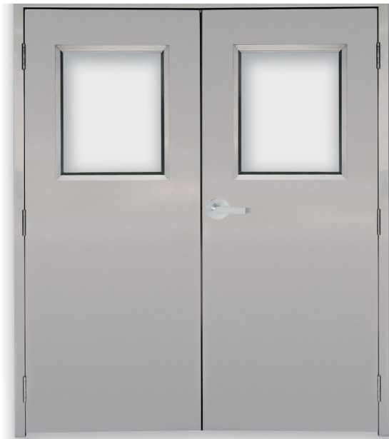
Shown with optional vision panel

Using cutting-edge technology and exacting criteria for quality, these doors have surpassed market demands and exceed cGMP, FDA and EU requirements. Our quest for uncompromising quality, and our steadfast commitment to meet our customers' ever-changing expectations, is evident in our ability to provide a comprehensive single source for all their door, hardware and integration needs.