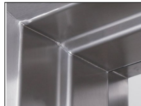
Frame Assembly Fully mitered and completely welded through the throat. Single or double rabbet

WIC = Door Opening Width in Clear HIC = Door Opening Height in Clear