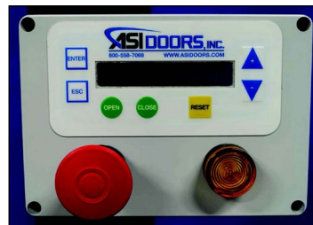
Remote HMI Digital Display