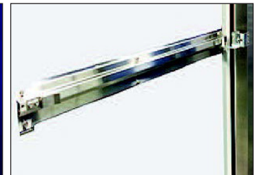
Standard Stainless Steel Breakaway Wall Track