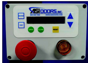
Remote HMI Digital Display