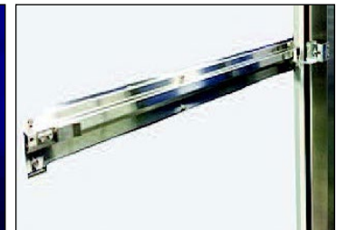
Standard Stainless Steel Breakaway Wall Track