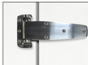
CAM Lift Hinges