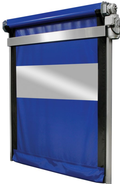
Shown with optional side covers and full vision panel

Superior aesthetics, uncompromising quality, exceptional reliability and unmatched value define the 515 doors. Designed from the ground up to far exceed the offerings of other door manufacturers, yet priced to meet demanding budget constraints, is truly the "no compromise" clean door solution.